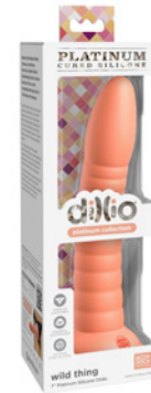
DILLIO PLATINUM: WILD THING 7" PEACH PD5386-43 MSRP: $54.99