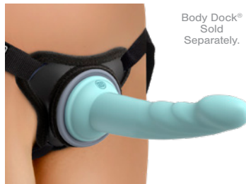
Body Dock® Sold Separately.