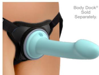
Body Dock® Sold Separately.