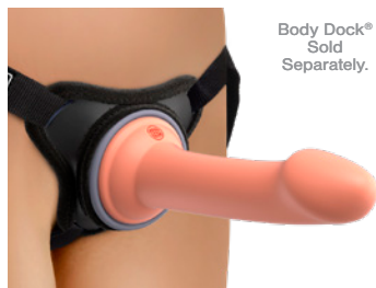
Body Dock® Sold Separately.