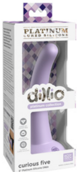
DILLIO PLATINUM: CURIOUS FIVE 5" PURPLE PD5383-12 MSRP: $39.99