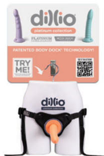
DILLIO PLATINUM: POP DISPLAY DILLIOPOP MSRP: $0.00