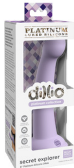
DILLIO PLATINUM: SECRET EXPLORER 6" PURPLE PD5384-12 MSRP: $44.99