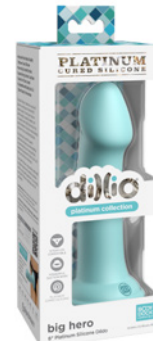
DILLIO PLATINUM: BIG HERO 6" TEAL PD5385-14 MSRP: $49.99