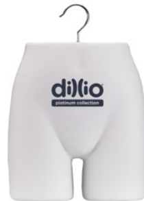
DILLIO PLATINUM: TORSO DILLIOPTORSO MSRP: $0.00