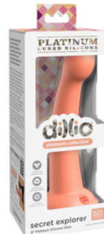
DILLIO PLATINUM: SECRET EXPLORER 6" PEACH PD5384-43 MSRP: $44.99