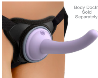
Body Dock® Sold Separately.