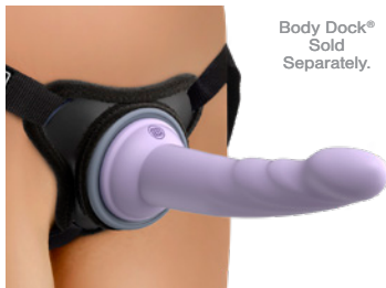
Body Dock® Sold Separately.