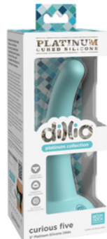
DILLIO PLATINUM: CURIOUS FIVE 5" TEAL PD5383-14 MSRP: $39.99