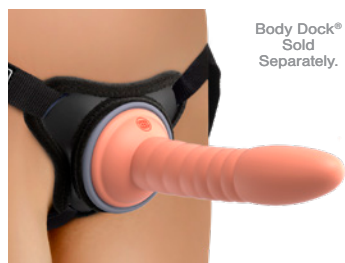
Body Dock® Sold Separately.