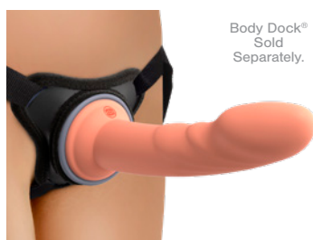
Body Dock® Sold Separately.