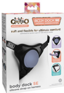
DILLIO PLATINUM: BODY DOCK SE UNIVERSAL HARNESS BD103-27 MSRP: $69.99