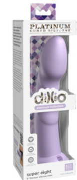
DILLIO PLATINUM: SUPER EIGHT 8" PURPLE PD5388-12 MSRP: $59.99