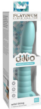
DILLIO PLATINUM: WILD THING 7" TEAL PD5386-14 MSRP: $54.99