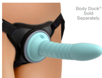
Body Dock® Sold Separately.