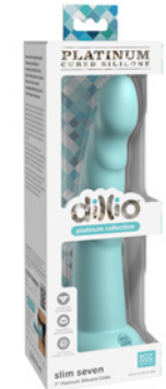
DILLIO PLATINUM: SLIM SEVEN 7" TEAL PD5387-14 MSRP: $54.99