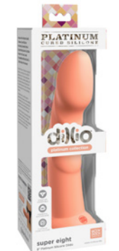
DILLIO PLATINUM: SUPER EIGHT 8" PEACH PD5388-43 MSRP: $59.99