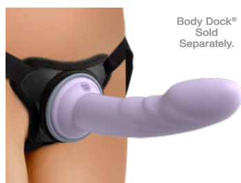
Body Dock® Sold Separately.