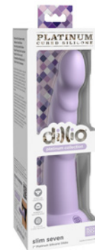
DILLIO PLATINUM: SLIM SEVEN 7" PURPLE PD5387-12 MSRP: $54.99