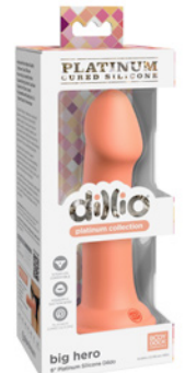
DILLIO PLATINUM: BIG HERO 6" PEACH PD5385-43 MSRP: $49.99