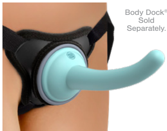
Body Dock® Sold Separately.